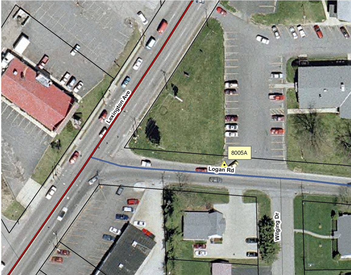
19c STATION SKETCH